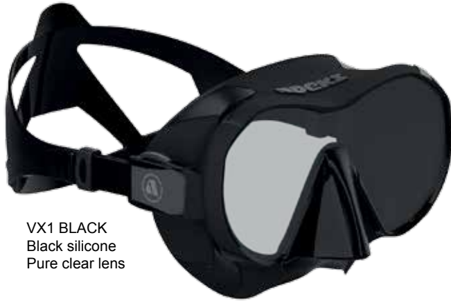
VX1 BLACK Black silicone Pure clear lens

The VX1 is the first frameless mask that finally addresses the technical diver's frustration of "fit fatigue". The advanced skirt geometry is designed to minimize facial pressure points during long duration dives. Offered in solid black or white surgical grade premium silicone and incorporating a choice of Pure View or UV Cut exclusive lens options for optimum visibility in all conditions.