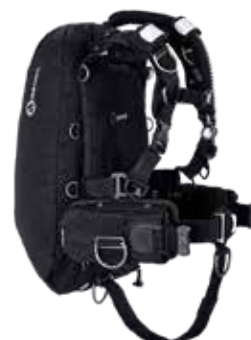
40lb donut with WTX harness and SureLock pockets.