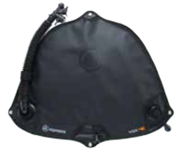
WSX-45 Primary Bladder