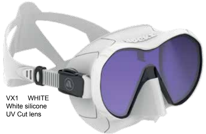
VX1 WHITE White silicone UV Cut lens