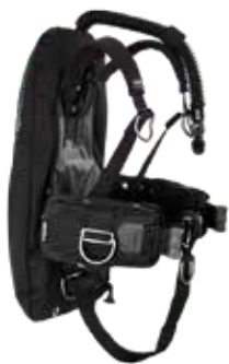
18lb donut with Ultralight Travel Plate, universal webbed harness, SureLock pockets and attachments.