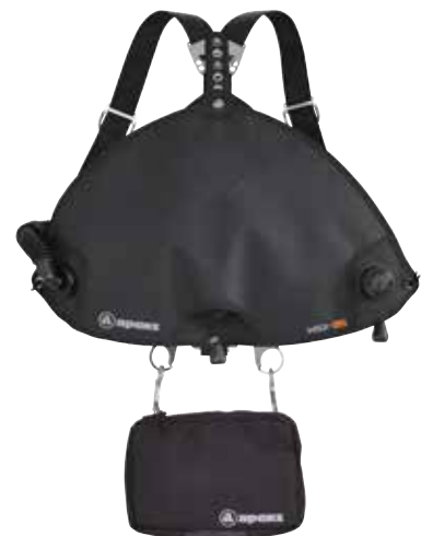
WSX Complete Sidemount System