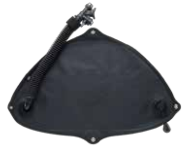
WSX-25 and WSX-45 Redundant Bladder