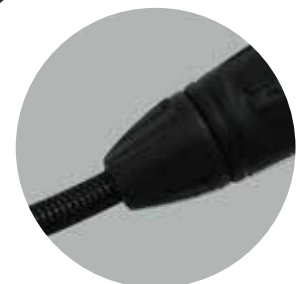
Optional HP Flex Hose