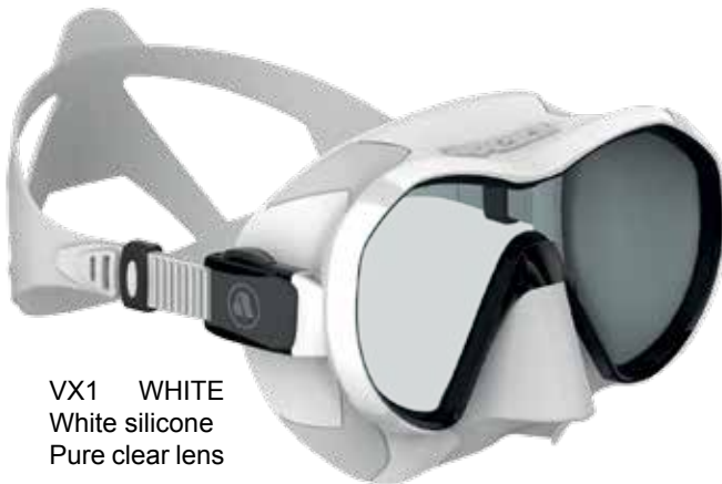
VX1 WHITE White silicone Pure clear lens