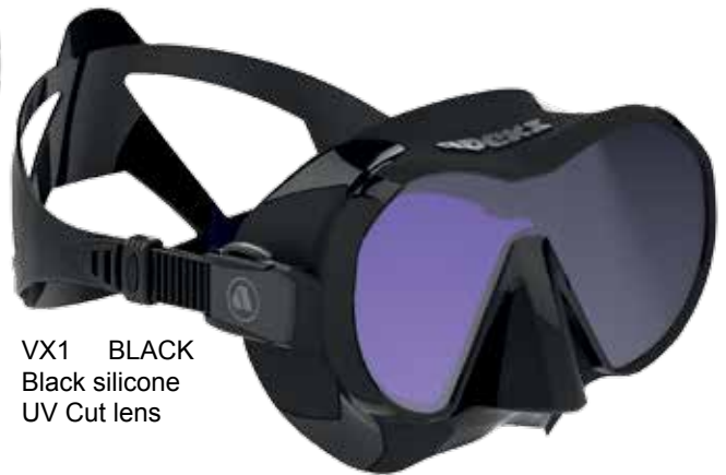
VX1 BLACK Black silicone UV Cut lens