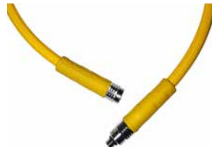
Double Swivel Octopus Hose