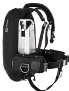
30lb donut with aluminum back plate, universal harness, SureLock pockets and attachments.