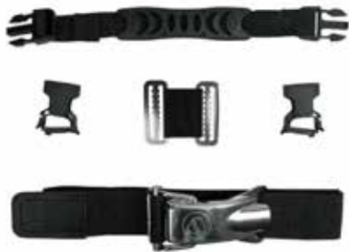
Twin Cylinder Kit