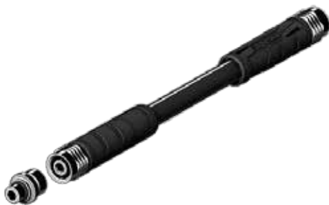
Double Swivel Hose